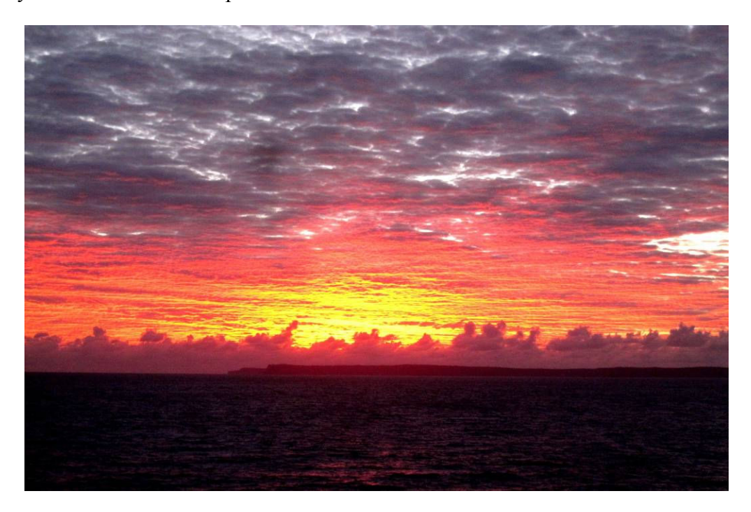
Day 55 – At Sea – Sunrise – Dateline – Marty Brill - 2<sup>nd</sup> 19 Nov. 09: The day started with moderate sea, temperature in the high 70s, and partly cloudy. The partly cloudy condition combined with a burst of sunlight coming over the horizon created a morning picture with a brilliance we have seldom seen. Barbara tried to capture the fleeting beauty of the moment in the photos below.